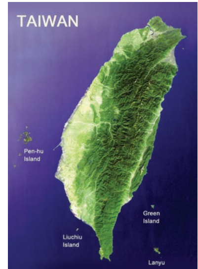
World Day of Prayer Writing Committee, Taiwan