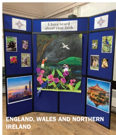
ENGLAND, WALES AND NORTHERN IRELAND