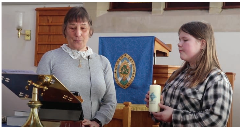
WDP Scotland's Closing Blessing