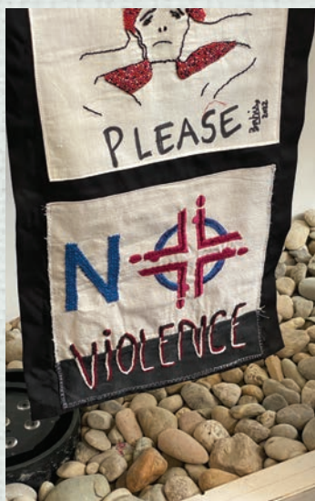
WCC Quilt Detail of WDP logo