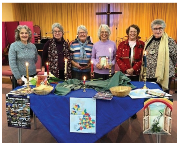
WDP Women of England, Wales and Northern Ireland

The ongoing COVID-19 pandemic presented both challenges and blessings. Many people have been isolated during the past few years, but the increasing number of virtual services made it possible for people to worship online. We prayed that some physical services would be held, and they were.