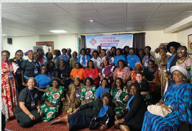
Africa regional conference group photo