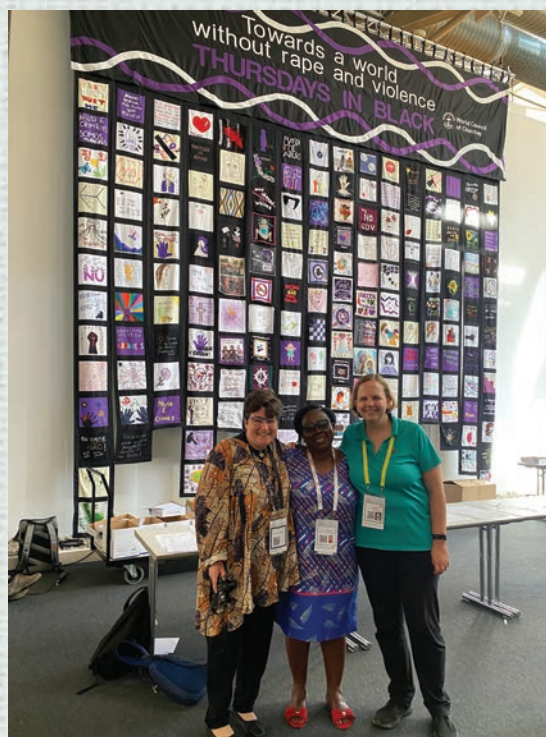
WCC quilt for Thursdays in Black

The World Day of Prayer has been in relationship with the World Council of Churches (WCC) since its inception. The theme for our 1938 WDP service, " The Church, A World Fellowship ," was chosen to support the foundation of a World Council of Churches planned for that year. Although the WCC was not launched until 1948, because of the outbreak of World War II, our WDP worship services focused on peace and reconciliation during that period.