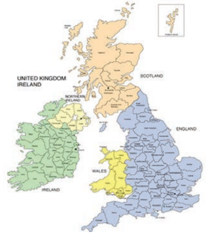
World Day of Prayer Writing Committee, WDP England, Wales and Northern Ireland