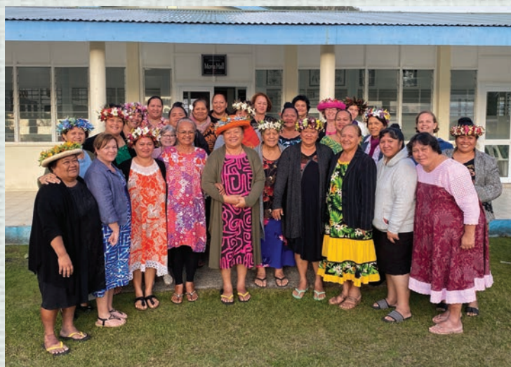
Cook Islands Workshop

During the workshop, the women from Cook Islands explored questions about