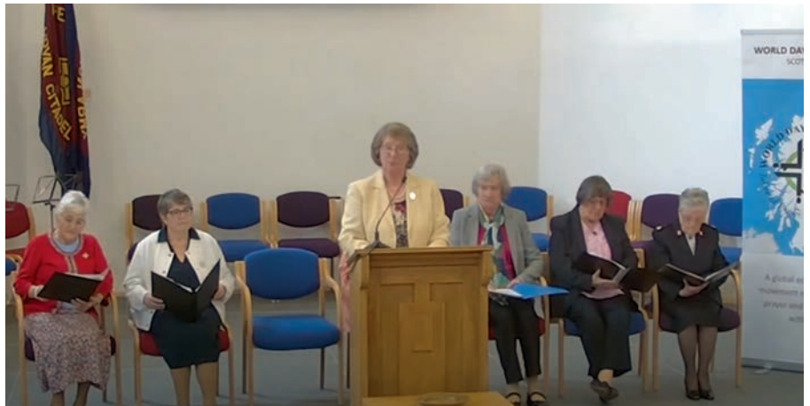
Opening Ceremony with WDP Scotland

The World Day of Prayer International Committee (WDPIC) was formed in 1968, and since then, we have held an International Meeting every 4-5 years. International Meetings are a time to share, decide, vote, network, listen, talk, report, learn, sing, pray, and plan. Each meeting is a unique experience full of blessings. Together we envision the future of this global and local ecumenical movement for justice and peace.